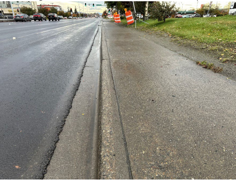
Figure 4.2 – Minnesota Dr after the fall sweep.