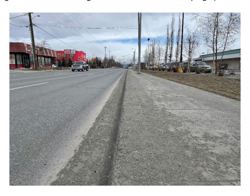
Figure 6.6 – Northern Lights Boulevard after sweeping operations.