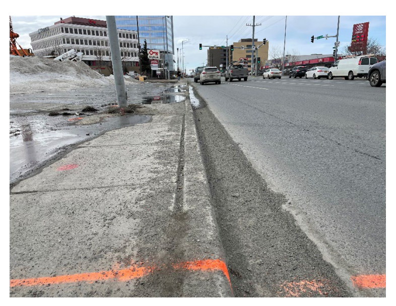
Figure 6.2 – Northern Lights Boulevard after sweeping operations